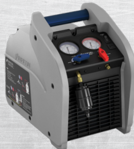
Vortex® Dual REFRIGERANT RECOVERY MACHINE 714-202-G1