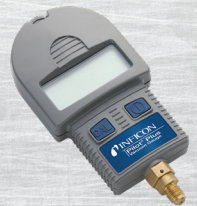
Pilot® Plus VACUUM GAUGE 710-202-G1