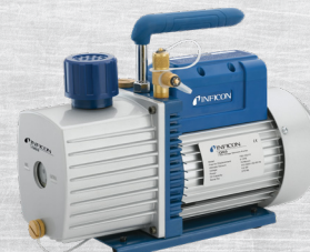
QS5 VACUUM PUMP 700-100-P1