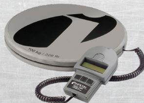
Wey-TEK® REFRIGERANT CHARGING SCALE 713-202-G1