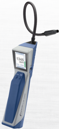
D-TEK Stratus® REFRIGERANT LEAK DETECTOR AND PORTABLE MONITOR 724-202-G1

INFICON offers tools certified by independent test labs* for A2L refrigerants to give you confidence and peace of mind.