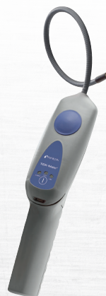
TEK-Mate® REFRIGERANT LEAK DETECTOR 705-202-G1