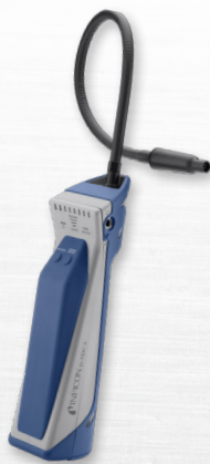
D-TEK® 3 REFRIGERANT LEAK DETECTOR 721-202-G1