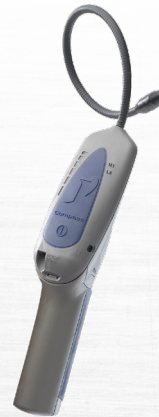
Compass® REFRIGERANT LEAK DETECTOR 717-202-G1