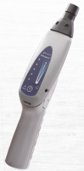
Whisper® ULTRASONIC LEAK DETECTOR 711-202-G1