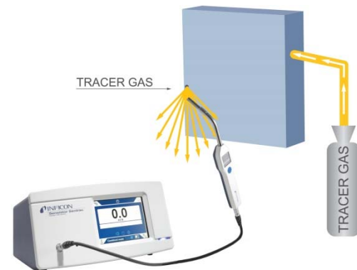
Assembled hydrogen tanks are often tested by hydrogen sniffing.

For the sniffing test the assembled hydrogen tank is filled with forming gas – a non-flammable 5% hydrogen in 95% nitrogen gas mixture. The sniffer probe of a Sensistor Sentrac hydrogen leak detector is then guided along potential leak locations. If forming gas escapes from any leaks, it is detected by the sniffer probe and the leak detector will alarm. This allows for the leaks to be exactly located and the leak location can be reported to any rework stations.