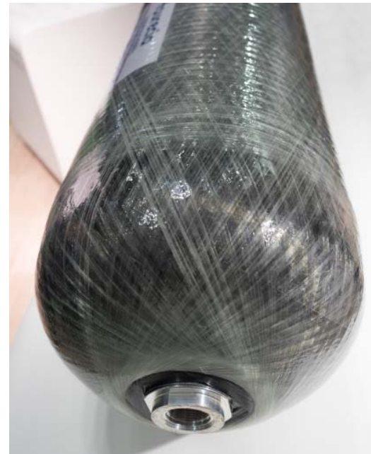
Type IV composite tanks are typically used for hydrogen storage in fuel cell vehicles.

Safety regulations (ISO/TS 15869) require that hydrogen tanks are tested for leakage / permeation. Permeation rates are measured as Normal liter of H 2 /time in hr/volume of the tank. Different standards define slightly different maximum allowable permeation rates. Any leak rate that is higher than the maximum allowable permeation rate is consider a leak. Typical maximum allowable permeation rates range in the 10 -2 mbar l/s decade. However, manufacturers often achieve permeation rates of about ten times lower permeation, i.e. in the 10 -3 mbar l/s range. Hence, leak rate limits are set in the 10 -3 ... 10 -2 mbar l/s range.